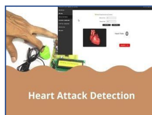
Heart Attack Detection