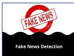
Fake News Detection