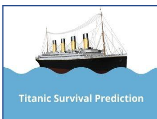
Titanic Survival Prediction